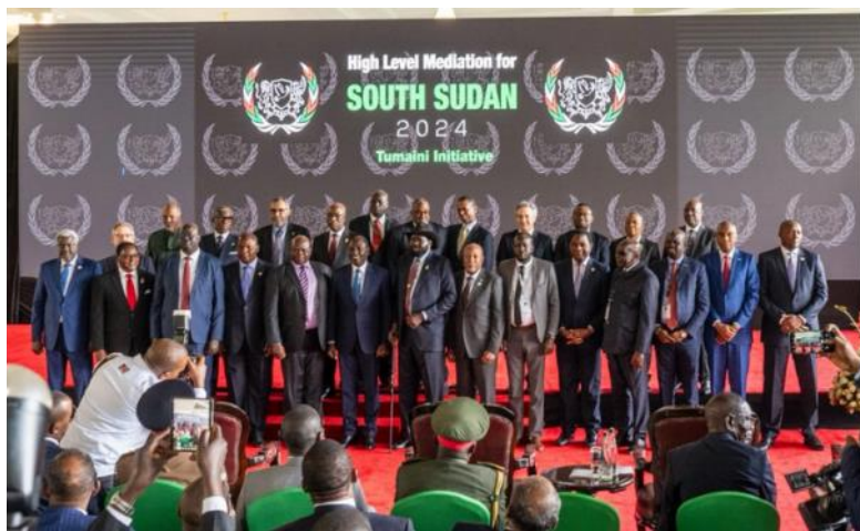
Leaders pose for photograph at the Tumaini Initiative in Nairobi on Thursday, May 9, 2024.

The NAS-RCC plans to address historical injustices, including land-grabbing, by launching programs for national reconciliation including a general amnesty. The NAS-RCC has recruited allies and supporters of its approach in neighboring countries and in the Organization for African Unity. A federal system of constitutional governance is again proposed, with in-